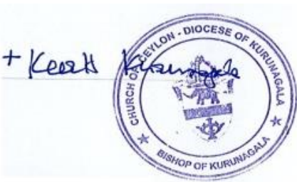
The Right Reverend Keerthisiri Fernando The Presiding Bishop of the Church of Ceylon & Bishop of Kurunegala

The suffering masses will have no option but to intensify their struggle since they are not heard by those selfishly clinging on to power. As a Church, we will support and stand by our people as they engage in peaceful demonstrations commencing from the 8 th instant, calling for meaningful change in the direction of our country. We continue to pray for our land and for wisdom to navigate through these difficult times.